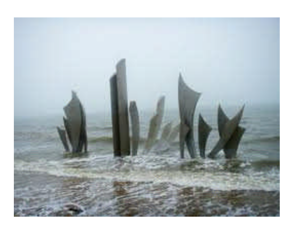
Les Braves , French sculptor Anilore Banon's tribute on Omaha Beach