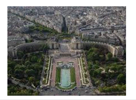
The National Maritime Museum, a.k.a., la Musée National de la Marine