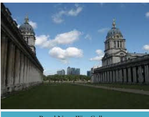
Royal Navy War College