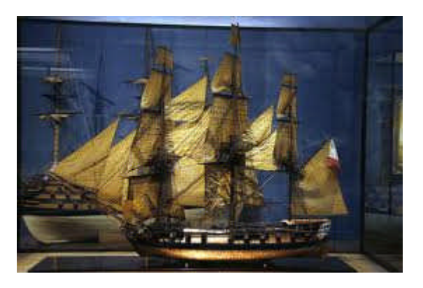
A sample of the many models at the museum